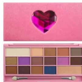
Unicorn Love Palette