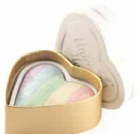
Unicorns Heart R120.00