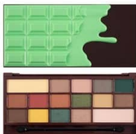
I ♥ Chocolate - Mint Chocolate R199.99