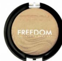
Pro Highlight Glow R85.00