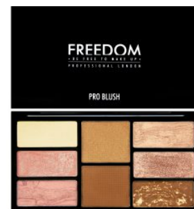
Pro Blush Palette Bronze and Baked R180.00