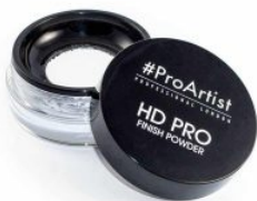
HD Pro Finish Powder - Translucent Loose R99.00