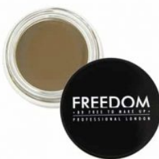
BROW POMADE BLONDE