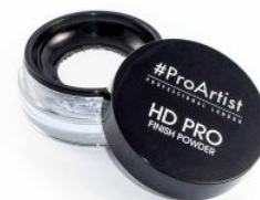
HD Pro Finish Powder - Translucent Loose R99.00