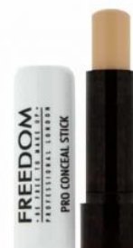
Pro Conceal Stick - Light R35.00