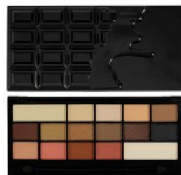
Wonder Palette Chocolate Vice