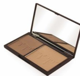
Bronze and Glow R125.00 R80.00