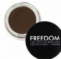
Pro Brow Pomade - Dark Brown R90.00