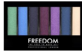
Pro Shade & Brighten - Play Kit R62.00