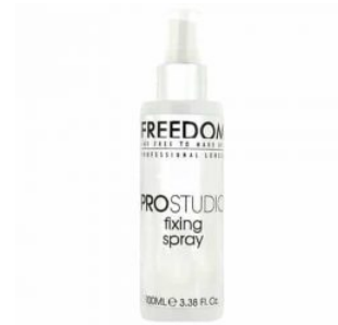
Pro Studio Fixing Spray 100ml R120.00 R90.00