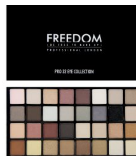
Pro 32 Innocent Collection R180.00