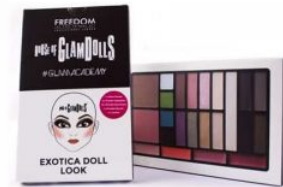
GlamDolls - Exotica Doll R185.00 R150.00