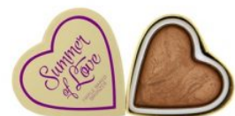
Love Hot Summer Bronzer