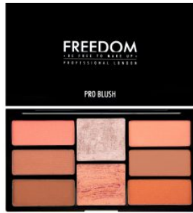
Pro Blush Palette Peach and Baked R180.00