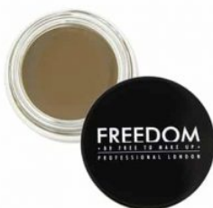
BROW POMADE BLONDE R90.00