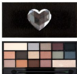
Naked Underneath Fur R190.00 R129.99