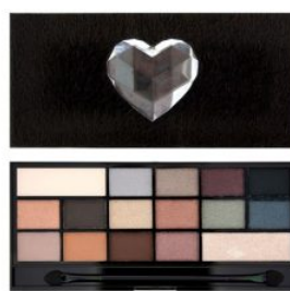
Naked Underneath Fur