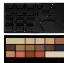
Wonder Palette Chocolate Vice R200.00