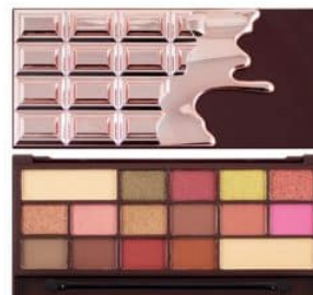
I ♥ Chocolate - Rose Gold R200.00