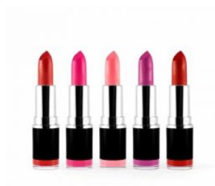
Retro Mattes Collection