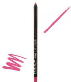
Lipliner - Pink (Single) R45.00