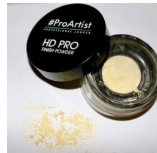
HD Pro Finish Banana - Loose R140.00