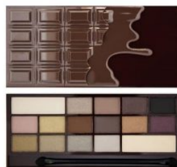
I ♥ Wonder Palette Death By Chocolate R180.00 R129.99