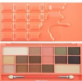
Chocolate and Peaches