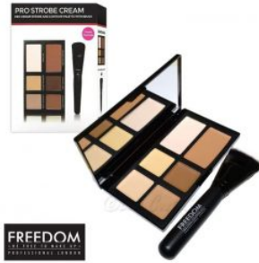
Pro Cream Strobe Palette with Brush R250.00