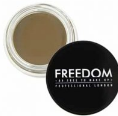
BROW POMADE BLONDE