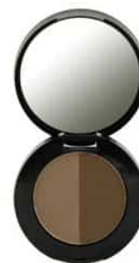
Duo Eyebrow Powder - Dark Brown R80.00