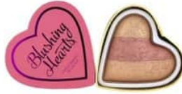
PEACHY KEEN HEART BLUSHER R120.00