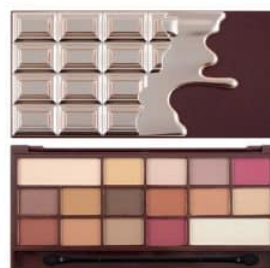
Chocolate Elixir Palette R199.99