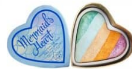
Mermaid's Heart Highlighter