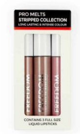
Pro Melts Stripped Collection