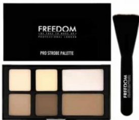
Pro Powder Strobe Palette with Brush