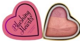
Candy Queen of Hearts Blusher R120.00