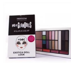
GlamDolls - Exotica Doll