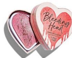
BLEEDING HEART HIGHLIGHTER R120.00