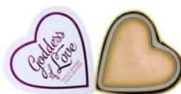
Golden Goddess R120.00 R100.00