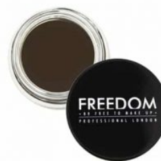
Pro Brow Pomade Ebony