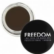
Pro Brow Pomade Ebony R90.00