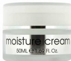
Pro Studio Moisture Cream R155.00 R99.00