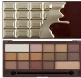
I ♥ Chocolate - Golden Bar R180.00