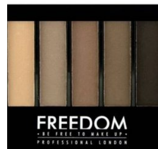
Pro Shade & Brighten Mattes Kit 1 R62.00