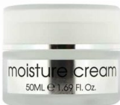
Pro Studio Moisture Cream R155.00 R99.00