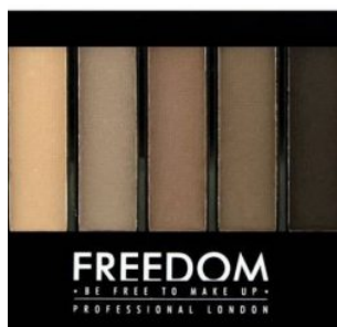
Pro Shade & Brighten Mattes Kit 1 R62.00