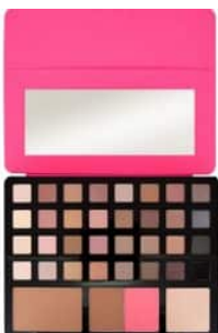
Pro Artist Pad-Studio Go Pink