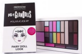
GlamDolls - Fairy Doll R185.00 R150.00