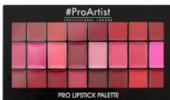
Pro Lipstick Palette x 24 - Reds