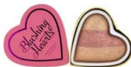
PEACHY KEEN HEART BLUSHER R120.00