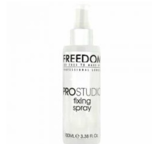
Pro Studio Fixing Spray 100ml R120.00 R90.00