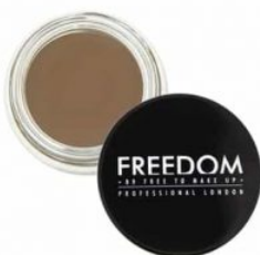
Pro Brow Pomade Soft Brown R90.00