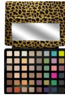
Pro Artist Pad Extreme Vice R350.00