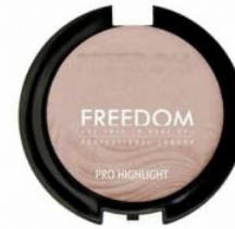
Pro Highlight Ambient