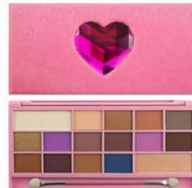
Unicorn Love Palette R160.00