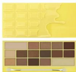
Wonder Palette Naked Chocolate R180.00