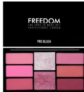
Pro Blush Palette Pink and Baked R180.00