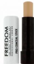
Pro Conceal Stick - Medium/Dark