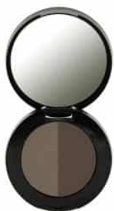
Duo Eyebrow Powder - Ash Brown R80.00