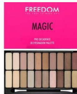
DECADENCE PALETTE - MAGIC R140.00