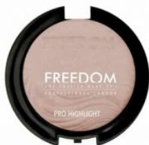
Pro Highlight Ambient