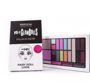
GlamDolls - Fairy Doll