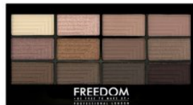
Pro 12 Audacious 3 R95.00