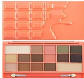
Chocolate and Peaches R180.00