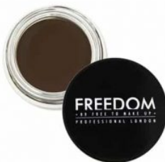
Pro Brow Pomade - Dark Brown