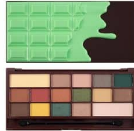
I ♥ Chocolate - Mint Chocolate