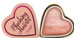
Peachy Pink Kisses R110.00