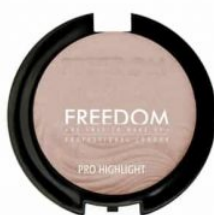
Pro Highlight Ambient R85.00