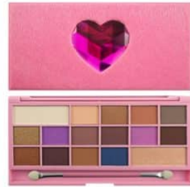
Unicorn Love Palette