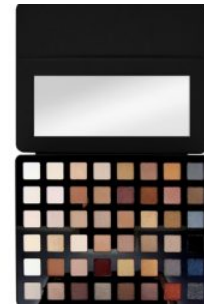
Pro Artist Pad Black Arts (Black)