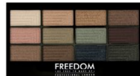
Pro 12 Romance and Jewels R95.00