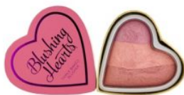
Candy Queen of Hearts Blusher