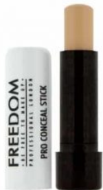
Pro Conceal Stick - Light