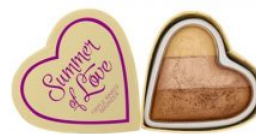
Hot Summer of love R120.00