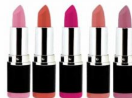
Pink Lipstick Collection (Box) R150.00 R99.99