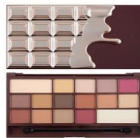
Chocolate Elixir Palette