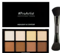
HD Highlighter & Contour Set (with double ended brush)