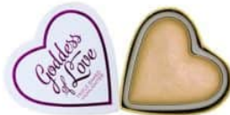
Golden Goddess R120.00