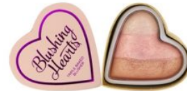
Blushing Hearts Iced Hearts R120.00