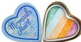
Mermaid's Heart Highlighter