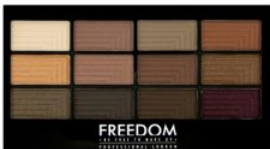
Pro 12 Secret Rose R95.00