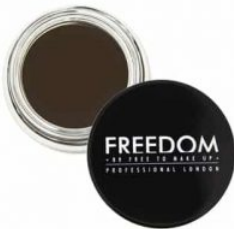
Pro Brow Pomade Ebony