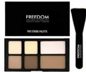
Pro Powder Strobe Palette with Brush R250.00