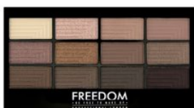
Pro 12 Audacious 3 R95.00