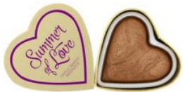
Love Hot Summer Bronzer R120.00