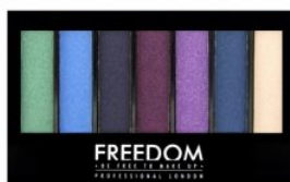
Pro Shade & Brighten - Play Kit R62.00