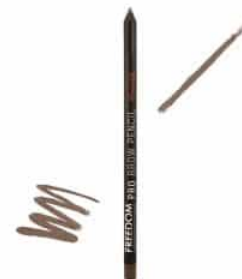
Pro Brow Pencil Soft Brown R45.00