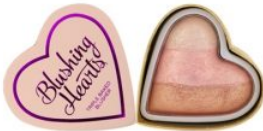
Blushing Hearts Iced Hearts R120.00