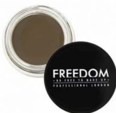
Pro Brow Pomade Medium Brown R90.00