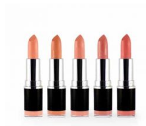
Naked Mattes Collection R150.00