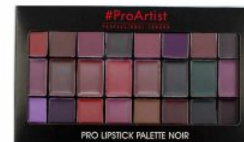
Pro Lipstick Palette x 24 - Noir