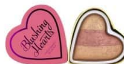
PEACHY KEEN HEART BLUSHER R120.00