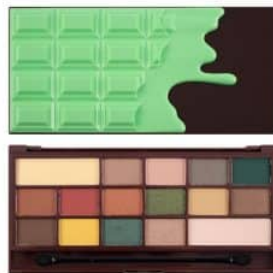
I ♥ Chocolate - Mint Chocolate R200.00