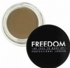
BROW POMADE BLONDE R90.00