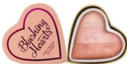
Peachy Pink Kisses