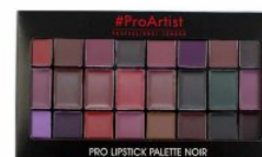
Pro Lipstick Palette x 24 - Noir