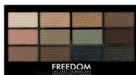
Pro 12 Romance and Jewels R95.00