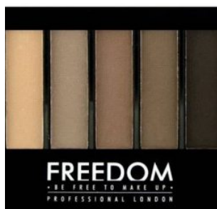
Pro Shade & Brighten Mattes Kit 1 R62.00