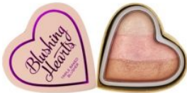
Blushing Hearts Iced Hearts R120.00