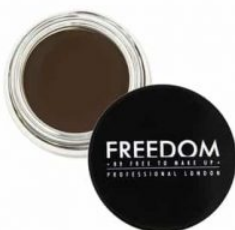
Pro Brow Pomade - Dark Brown R90.00