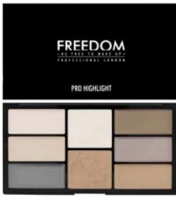
Pro Highlight Palette R140.00