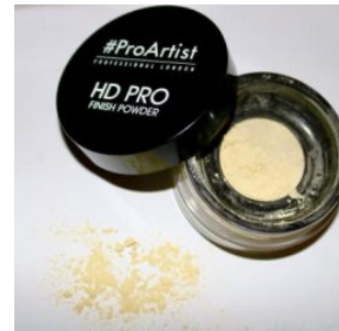
HD Pro Finish Banana - Loose R140.00 R98.00