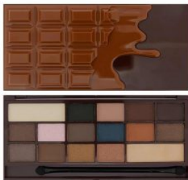
Chocolate Salted Caramel