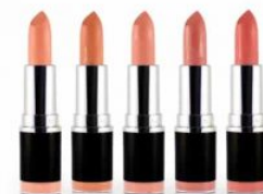
Naked Mattes Collection R150.00