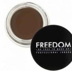
BROW POMADE CHOCOLATE