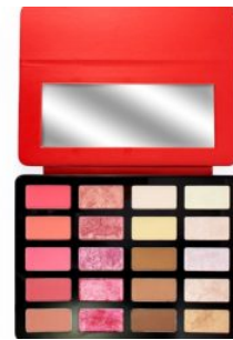
BACKSTAGE RED (IPAD Pallet) R350.00