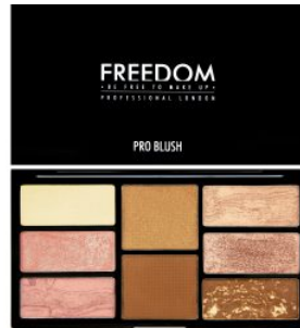
Pro Blush Palette Bronze and Baked R180.00