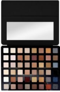
Pro Artist Pad Black Arts (Black)