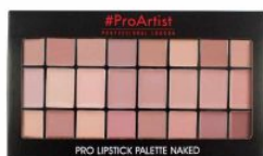
Pro Lipstick Palette x 24 - Naked