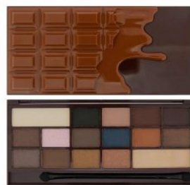
Chocolate Salted Caramel R180.00