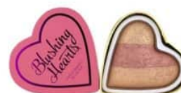
PEACHY KEEN HEART BLUSHER