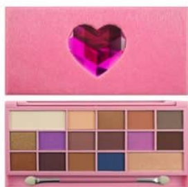
Unicorn Love Palette