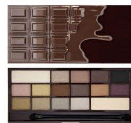
I ♥ Wonder Palette Death By Chocolate