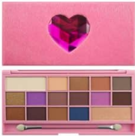
Unicorn Love Palette R160.00