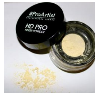
HD Pro Finish Banana - Loose R140.00 R98.00