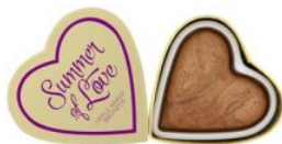
Love Hot Summer Bronzer R120.00