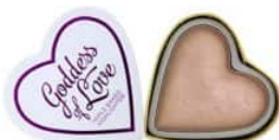
Goddess of Love