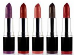
Noir Mattes Collection R150.00