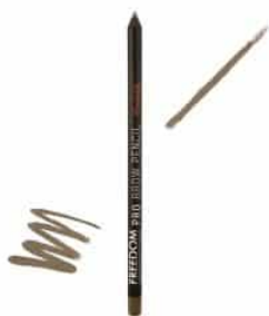
Pro Brow Pencil Dark Brown R45.00