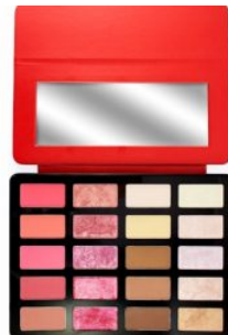
BACKSTAGE RED (IPAD Pallet) R350.00