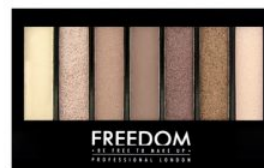
Pro Shade & Brighten Stunning Rose Kit R62.00