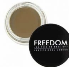
BROW POMADE BLONDE R90.00