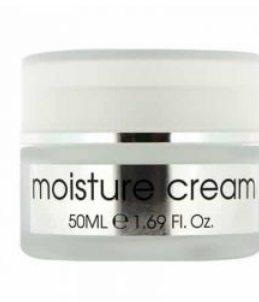
Pro Studio Moisture Cream R155.00 R99.00