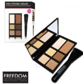
Pro Cream Strobe Palette with Brush