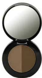
Duo Eyebrow Powder - Dark Brown R80.00