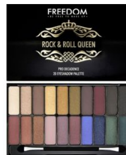
Decadence Palette Rock & Roll R140.00