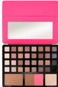
Pro Artist Pad-Studio Go Pink