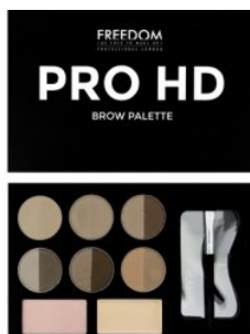
Pro HD Brow Palette - Fair Medium R250.00 R150.00