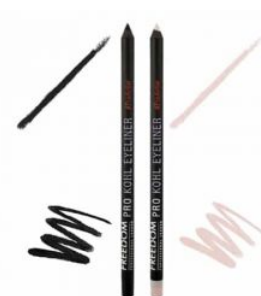
Pro Kohl Liner And Brighten Duo R90.00