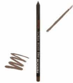
Pro Brow Pencil Soft Brown