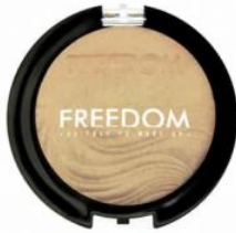
Pro Highlight Glow