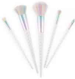
I Heart Makeup Unicorns Dream Brush Set