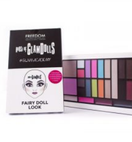
GlamDolls - Fairy Doll R185.00 R150.00