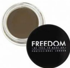
Pro Brow Pomade Medium Brown