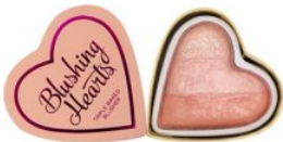
Peachy Pink Kisses R110.00