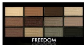
Pro 12 Stunning Smokes R95.00