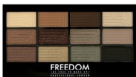
Pro 12 Stunning Smokes R95.00