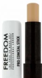
Pro Conceal Stick - Medium/Dark R35.00