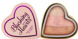
Blushing Hearts Iced Hearts R120.00