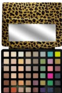
Pro Artist Pad Extreme Vice R350.00