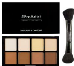
HD Highlighter & Contour Set (with double ended brush) R250.00