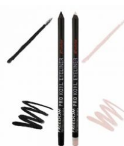
Pro Kohl Liner And Brighten Duo R90.00