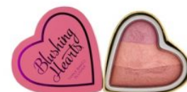
Candy Queen of Hearts Blusher