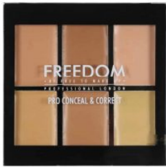
Pro Conceal Palette Light/Medium R80.00