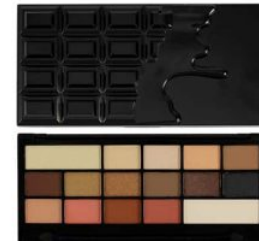
Wonder Palette Chocolate Vice R200.00 R150.00