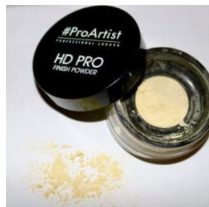
HD Pro Finish Banana - Loose R140.00