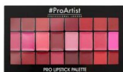
Pro Lipstick Palette x 24 - Reds