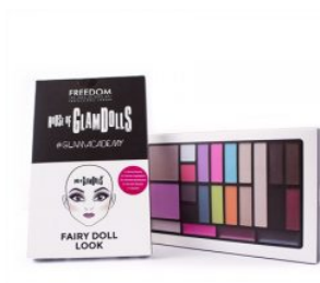
GlamDolls - Fairy Doll