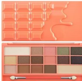
Chocolate and Peaches R180.00