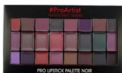
Pro Lipstick Palette x 24 - Noir