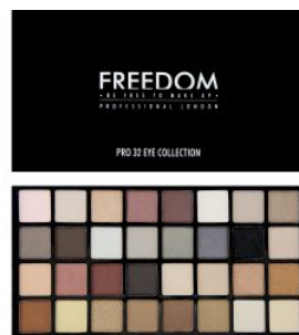
Pro 32 Innocent Collection R180.00