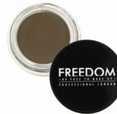
Pro Brow Pomade Medium Brown