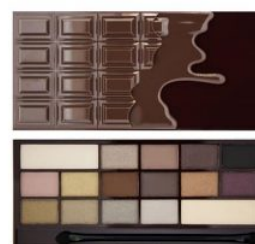
I ♥ Wonder Palette Death By Chocolate R180.00