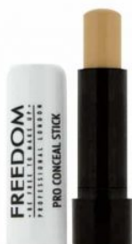
Pro Conceal Stick - Light/Medium R35.00