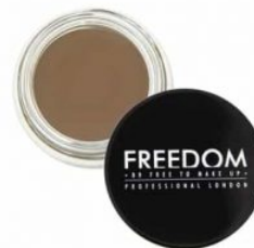
Pro Brow Pomade Soft Brown