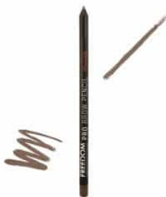
Pro Brow Pencil Soft Brown R45.00