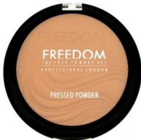
Pressed Powder - Shade 101 Translucent