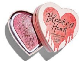
BLEEDING HEART HIGHLIGHTER R120.00