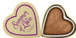
Love Hot Summer Bronzer R120.00