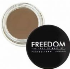
Pro Brow Pomade Soft Brown