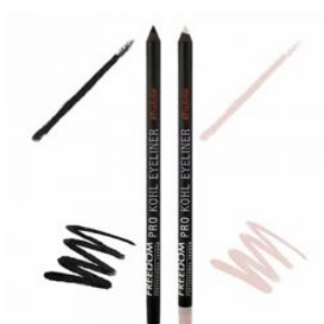
Pro Kohl Liner And Brighten Duo R90.00