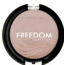
Pro Highlight Brighten R85.00