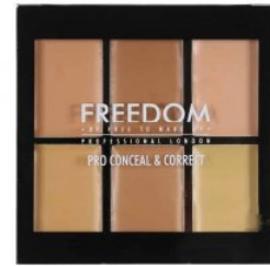
Pro Conceal Palette Light/Medium R80.00