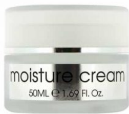
Pro Studio Moisture Cream R455.00 R99.00