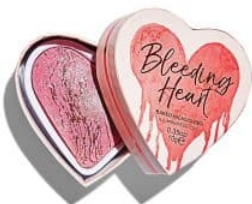
BLEEDING HEART HIGHLIGHTER