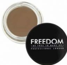
Pro Brow Pomade Soft Brown R90.00