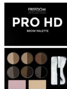
Pro HD Brow Palette Medium Dark R250.00