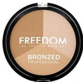
Pro Warm Lights R80.00