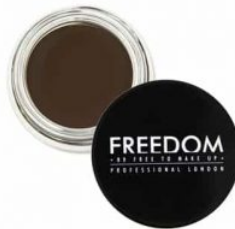
Pro Brow Pomade - Dark Brown