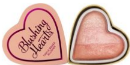
Peachy Pink Kisses