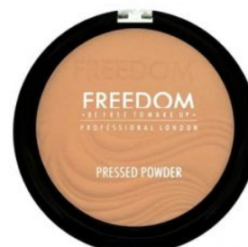
Pressed Powder - Shade 101 Translucent R80.00