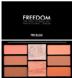
Pro Blush Palette Peach and Baked R180.00