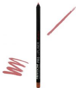
Lipliner - Nude (Single) R45.00