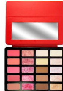
BACKSTAGE RED (IPAD Pallet)