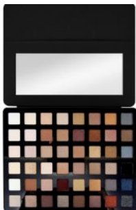
Pro Artist Pad Black Arts (Black)