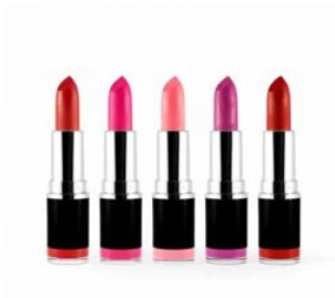
Retro Mattes Collection