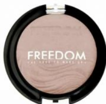
Pro Highlight Brighten