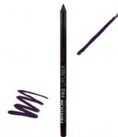
Freedom Pro Lipliner Vamp R45.00