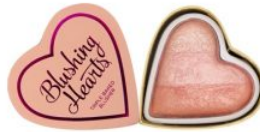
Peachy Pink Kisses R110.00