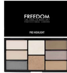
Pro Highlight Palette R140.00