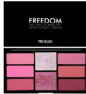
Pro Blush Palette Pink and Baked R180.00