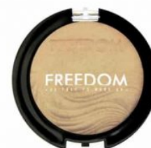
Pro Highlight Glow R85.00