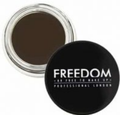
Pro Brow Pomade Ebony R90.00