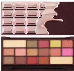
I ♥ Chocolate - Rose Gold