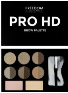
Pro HD Brow Palette - Fair Medium