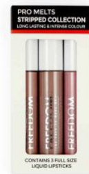
Pro Melts Stripped Collection R200.00