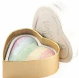
Unicorns Heart R120.00 R100.00