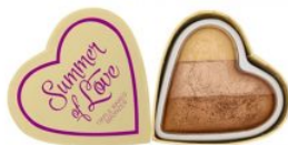
Hot Summer of love