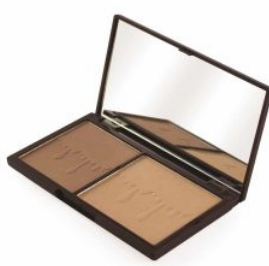
Bronze and Glow