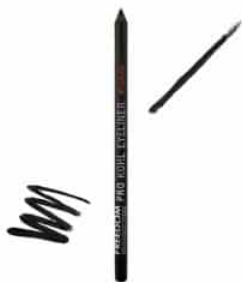
Pro Kohl Eyeliner Black R45.00