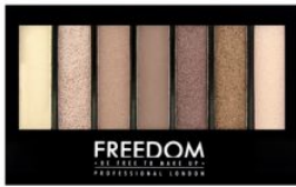
Pro Shade & Brighten Stunning Rose Kit R62.00