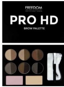
Pro HD Brow Palette Medium Dark