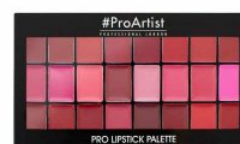
Pro Lipstick Palette x 24 - Reds