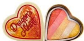
Dragon's Heart Highlighter R120.00