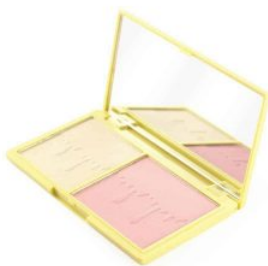
Light and Glow