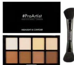
HD Highlighter & Contour Set (with double ended brush) R250.00 R185.00