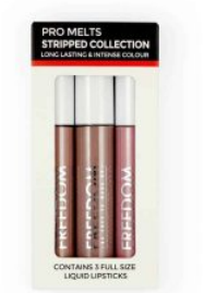
Pro Melts Stripped Collection