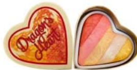
Dragon's Heart Highlighter