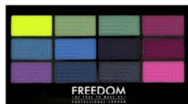
Pro 12 - Chasing Rainbows R95.00