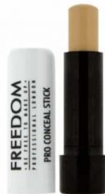
Pro Conceal Stick - Light/Medium