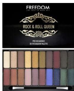
Decadence Palette Rock & Roll R140.00