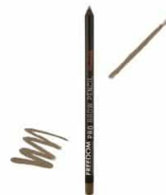
Pro Brow Pencil Dark Brown R45.00