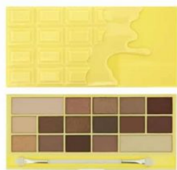
Wonder Palette Naked Chocolate