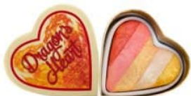
Dragon's Heart Highlighter R120.00