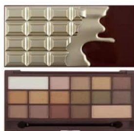
I Love Chocolate - Golden Bar