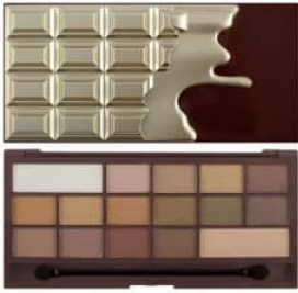
I ♥ Chocolate - Golden Bar R180.00