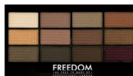
Pro 12 Secret Rose R95.00