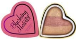
PEACHY KEEN HEART BLUSHER