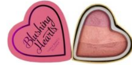
Candy Queen of Hearts Blusher R120.00