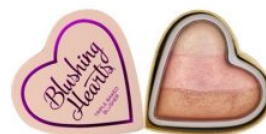
Blushing Hearts Iced Hearts