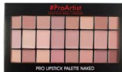
Pro Lipstick Palette x 24 - Naked