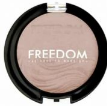
Pro Highlight Brighten