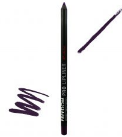
Freedom Pro Lipliner Vamp R45.00