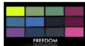
Pro 12 - Chasing Rainbows R95.00