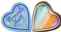
Mermaid's Heart Highlighter R120.00