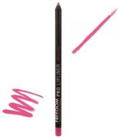
Lipliner - Pink (Single) R45.00