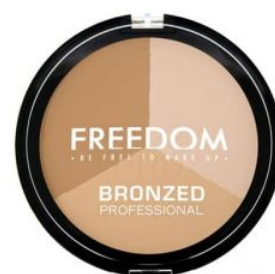
Pro Warm Lights