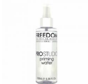
Pro Studio Priming Water R455.00 R99.00