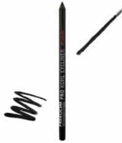
Pro Kohl Eyeliner Black