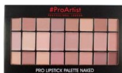
Pro Lipstick Palette x 24 - Naked